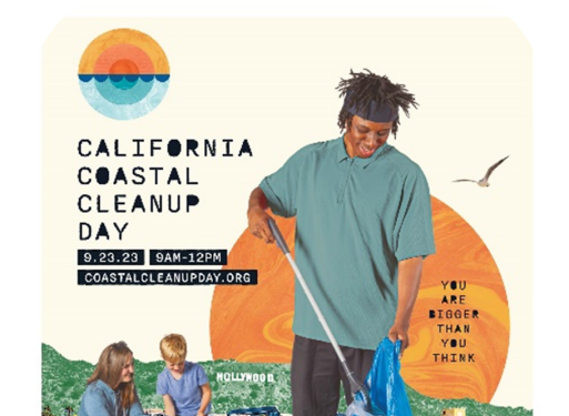
California Coastal Cleanup Day

September 9, 2023 9:00am - 12:00pm First Street Parking Lot