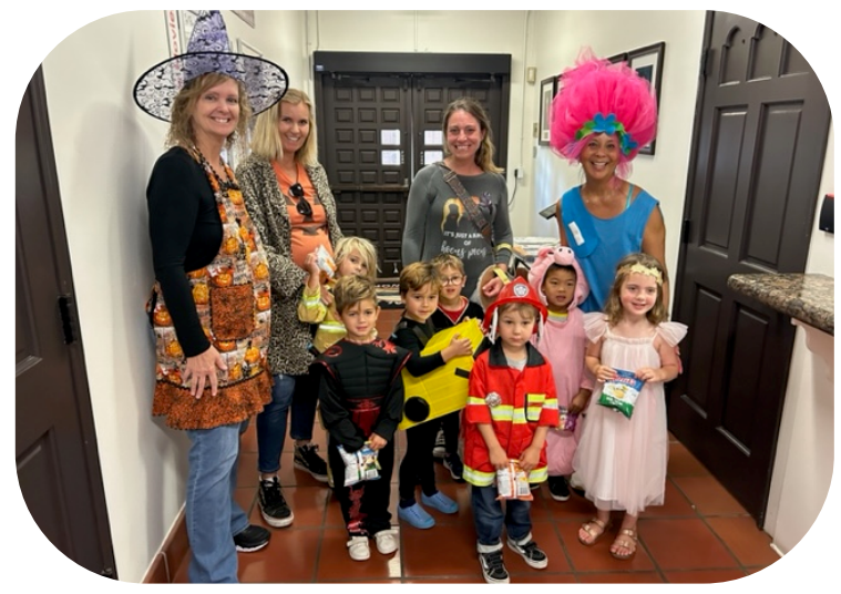
On Friday, October 27th, ghosts and goblins from the Seal Beach Playgroup visited City Hall, our City Manager and City staff for trick-ortreating.