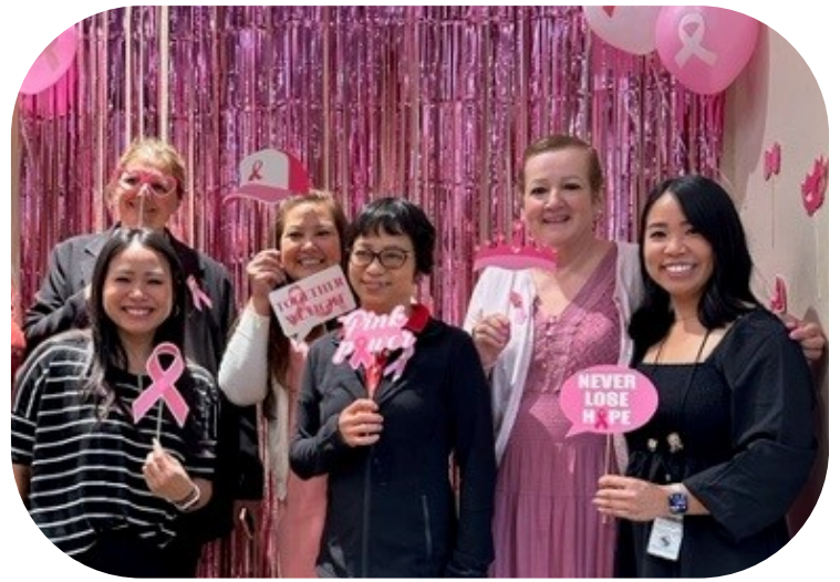
On Wednesday, October 25th, City staff gathered to celebrate Breast Cancer Awareness and our very own survivors.