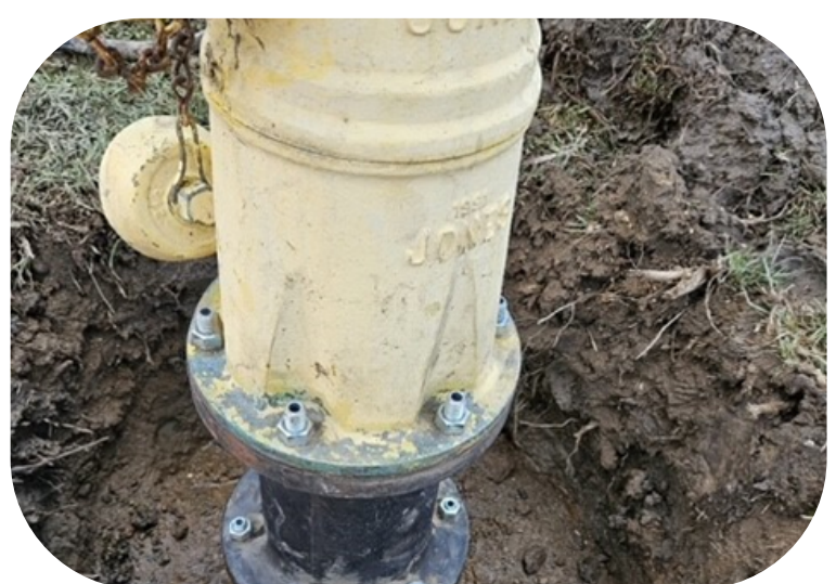
A leaking fire hydrant was reported in Leisure World following a minor car accident. Water operators quickly responded and replaced the damage.