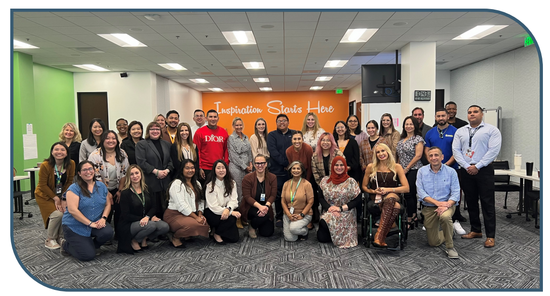
Staff attended a Community Suicide Prevention Coalition General Meeting.