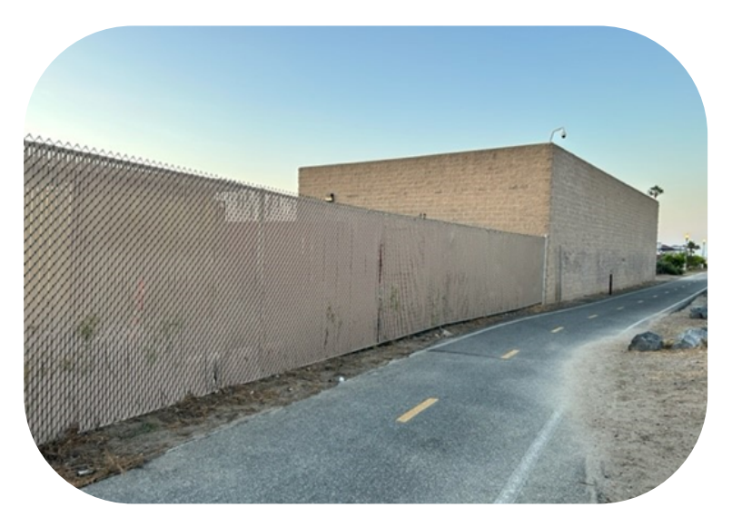
Staff installed privacy fence slats into the chain link fence located at the beach yard along the San Gabriel River bike trail.