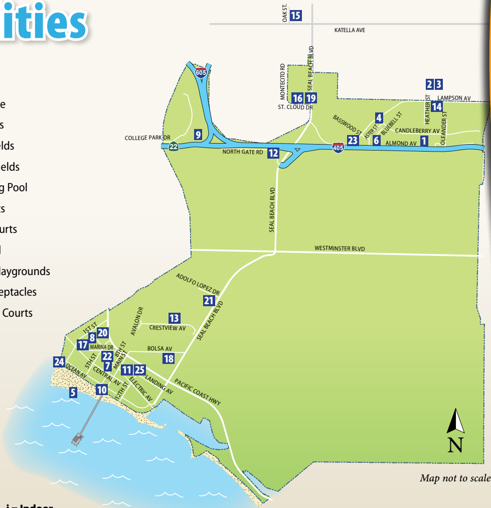
Map not to scale.